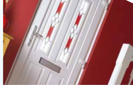
PVC-U door panels