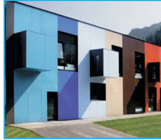
Formica Vivix An external grade decorative high-pressure laminate.