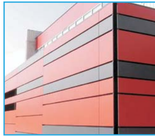
Trespa An external grade decorative high-pressure laminate.

We are centrally based, less than five minutes from Junction 31, M1 which makes it convenient for collecting and / or site delivery of materials.