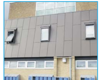
Rockpanel External cladding board manufactured from sustainable rock fibre.