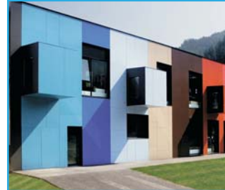
Formica Vivix An external grade decorative high-pressure laminate.