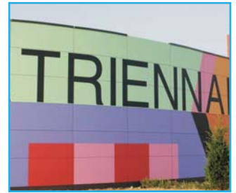
Abet - MEG Laminate An external grade decorative high-pressure laminate.