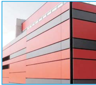
Trespa An external grade decorative high-pressure laminate.

We are centrally based, less than five minutes from Junction 31, M1 which makes it convenient for collecting and / or site delivery of materials.