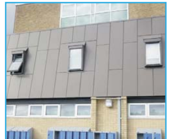
Rockpanel External cladding board manufactured from sustainable rock fibre.