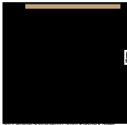
3m Lamina/Styrofoam/0.3mm Plastics/Steel