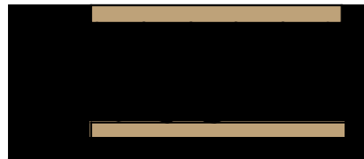
3m Lamina/Styrofoam/3m Lamina